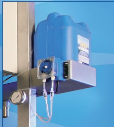
Clewer SR20 nutrient can 2.5 Gal, with dosage pump